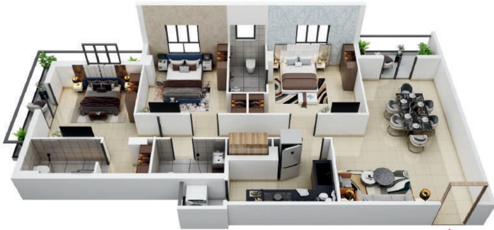
TYPICAL FLOOR PLAN 2ND to 9TH