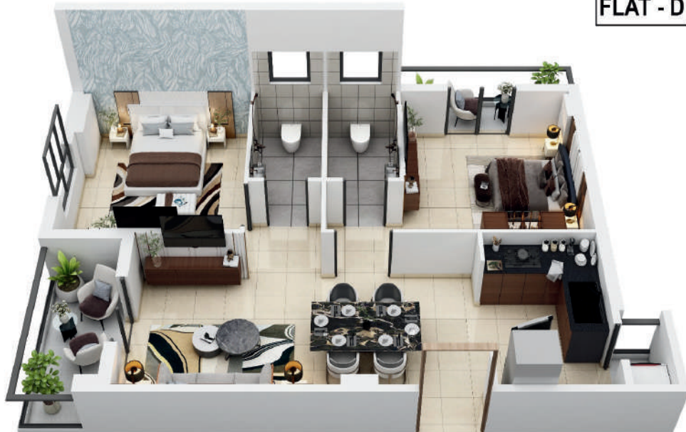
TYPICAL FLOOR PLAN 2ND to 9TH