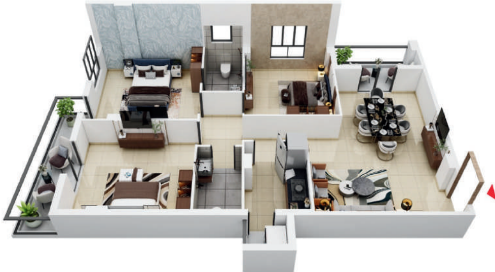
TYPICAL FLOOR PLAN 2ND to 9TH