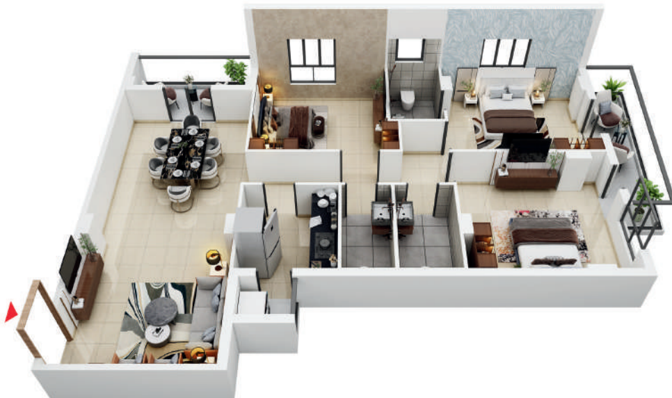
TYPICAL FLOOR PLAN 2ND to 9TH